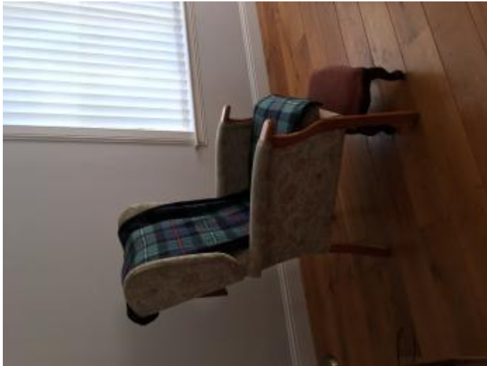
High backed chair