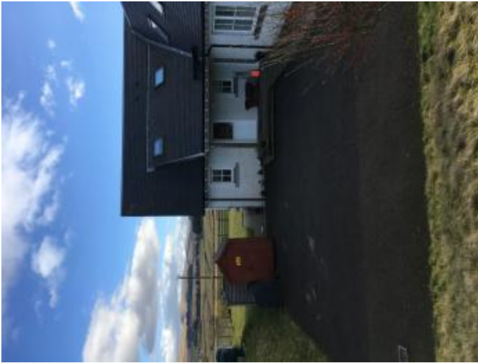
Parking /turning area beside ramp and entrance