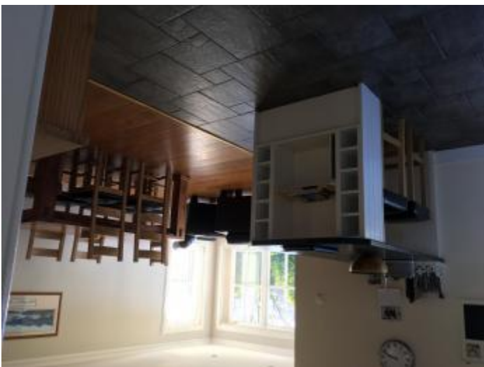
Kitchen to dining area with riased table to accomodate a wheel chair