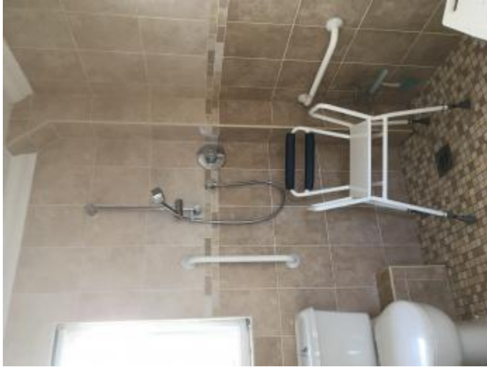
wetroom with adjustable shower head, choice of 2 shower chairs & grab rails