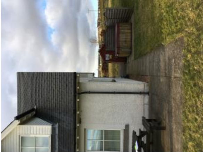
level slatted path surrounds whole house