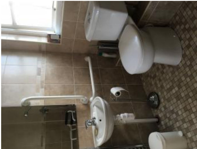
Raised toilet with grabrails, sink with lever taps and space underneath