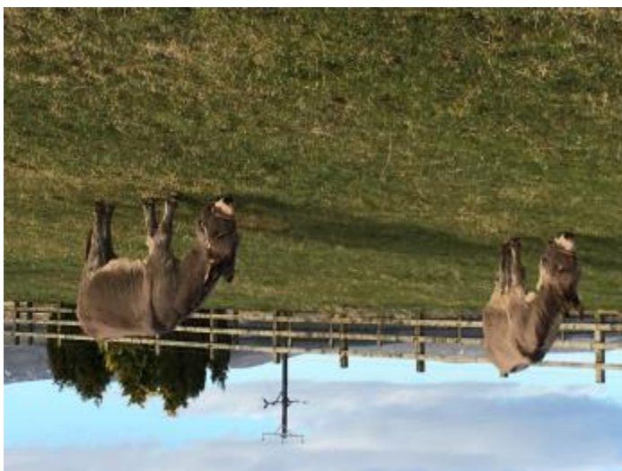
Meet the neighbours !